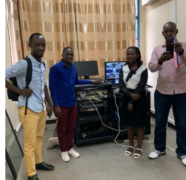
Team standing in front of new fire-wall and network