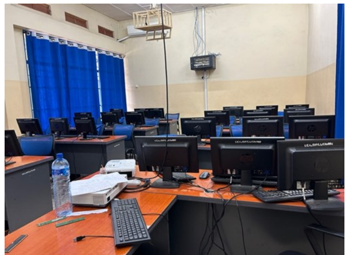
One of the two computer labs

As HAU continues to grow in size and complexity, the university needs appropriate technology to support its infrastructure and academic programs. Technology touches every aspect of the university; it impacts the effectiveness of academic program support, including the library. What a blessing it is to partner with HAU! Students are eager to learn and leave HAU to be a blessing in the world.